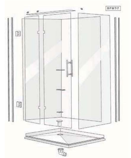
option one: with acrylic liner

Atlantis recommends installation of Black Pearl showers is undertaken by an approved Atlantis installer. See website or call 0800 428 526 for more details.